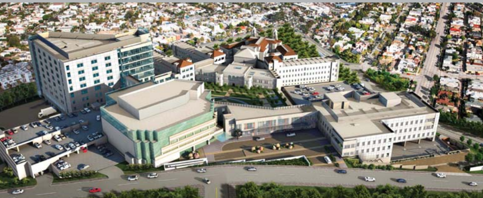
CAMPUS ARIAL - NORTH