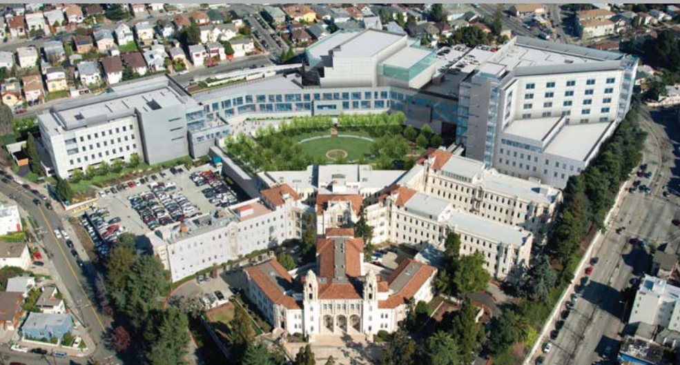
CAMPUS ARIAL - SOUTH

HIGHLAND HOSPITAL ACUTE TOWER REPLACEMENT PROJECT