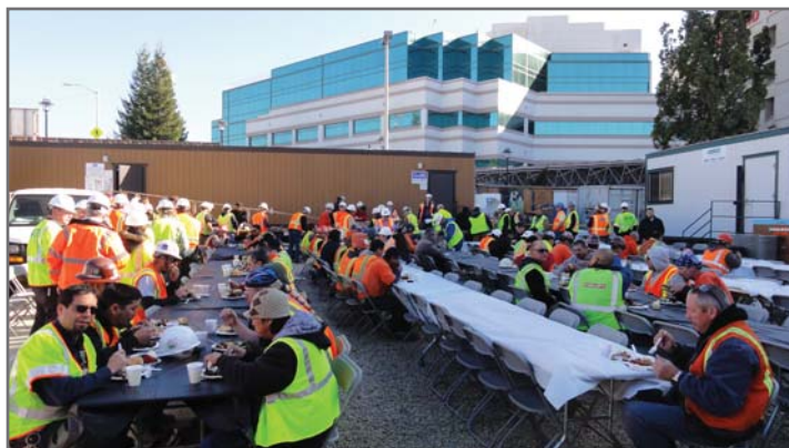
The ATR Project Team BBQ, celebrating the completion of the Specialty Care Center Structural Steel.

On December 21, 2011, the workers celebrated the completion of the Specialty Care Center Structural Steel work with an ATR Project BBQ. This is considered a major milestone for the ATR Project, and was completed ahead of schedule. Next, the project team will install the exterior walls of the Specialty Care Center.