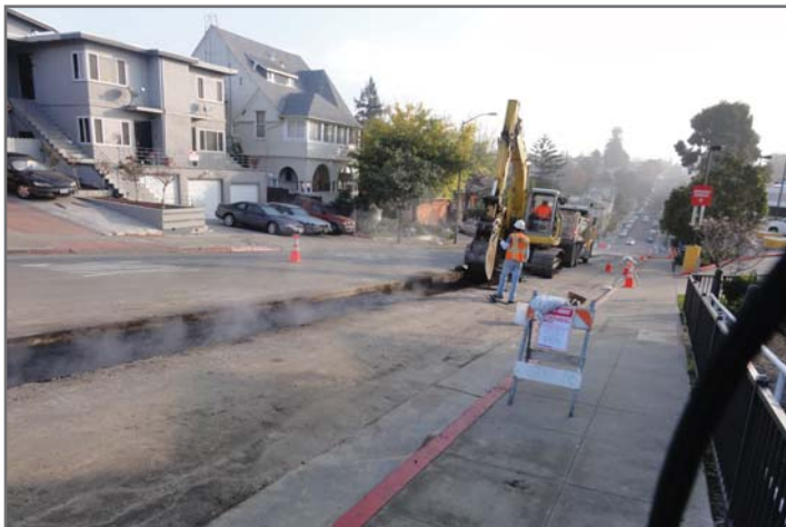
The two photos above are of the East 31st Street and Stuart Street underground electrical work for the new Acute Care Tower.