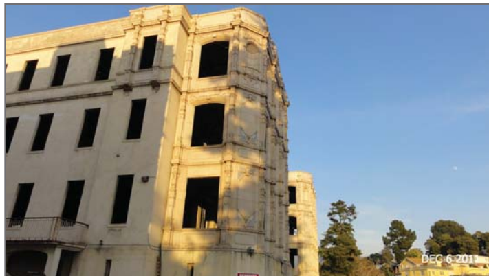
Only the shell of the C, D and F wings remains. Interior demolition of these buildings is complete and demolition of the structures begins in January.

Currently, the ATR Project Team has completed interior demolition of the C, D and F wings. This includes removal of all non-structural material such as flooring, windows, sheet rock, and heating and air conditioning systems, leaving only the concrete and steel.