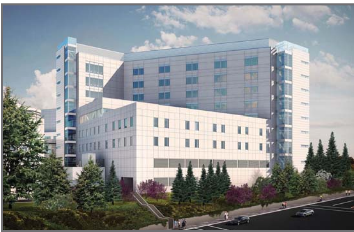
New Acute Care Tower, Completion in 2015